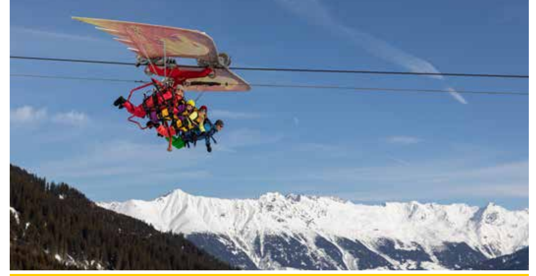
Fun & Action. Away from the Slopes.

Fisser Flieger. Serfauser Sauser. Skyswing. Schneisenfeger family toboggan run. Please refer to our Highlights folder for further details.